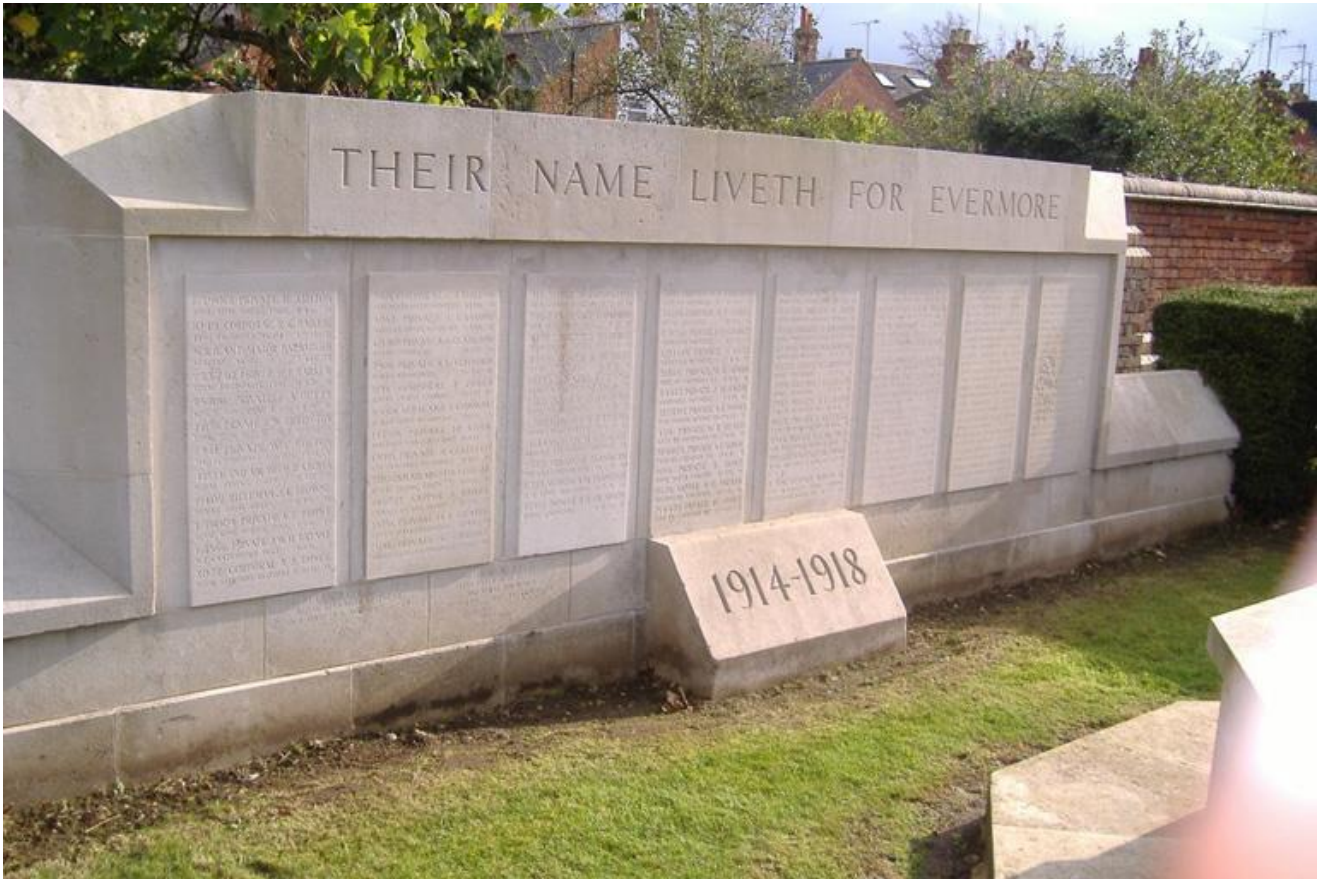
Photo of Pte J. Rowe's name on the Screen Wall Memorial in Reading Cemetery, Reading, Berkshire, England.